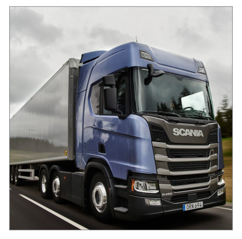
The new Scania R450 Truck