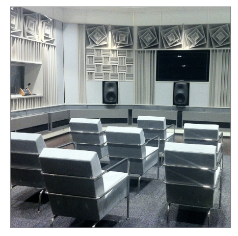
Scania's Listening Studio for subjective evaluations

Simulation of structure-borne sound in a Scania truck with the use of Actran